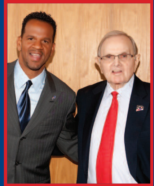
Distinguished Service Award winner Andre Reed (left) with Bills Owner Ralph C. Wilson, Jr.