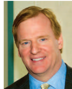
NFL Commissioner Roger Goodell was a featured speaker at a MQC luncheon

Following selected home games, the Club hosts luncheons featuring post game analysis, video highlights, a media personality as emcee and special guests from the Bills. A buffet lunch is included. Occasionally the Club hosts evening events as well.